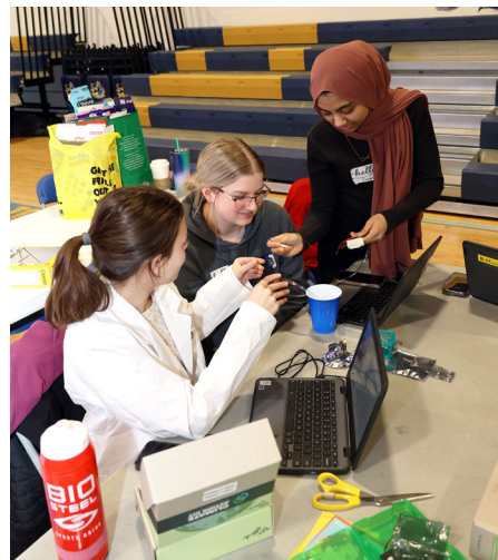
Students working on a science experiment.

The students also heard from civil, chemical and materials engineers, and worked in teams to build solar-powered lanterns, learn air quality testing techniques, code tools to pump water with electronic sensors, and took part in a pneumatics design challenge where they lifted heavy objects using air pressure and syringes.