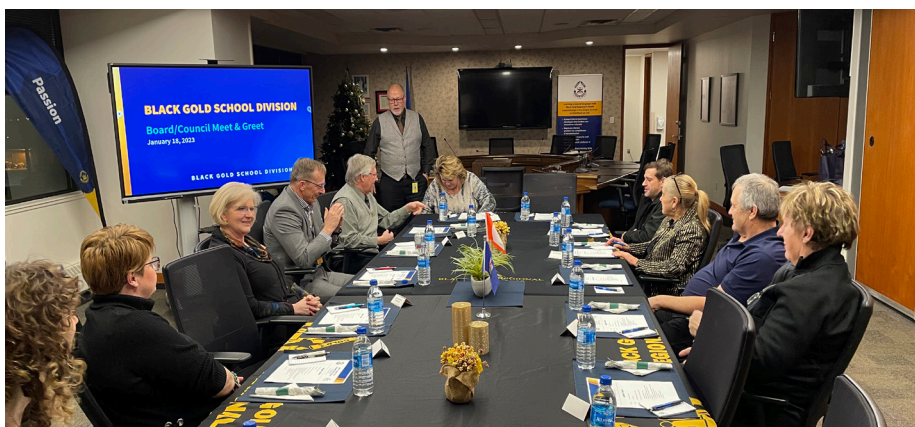
The Board of Trustees met with Thorsby Town Council.