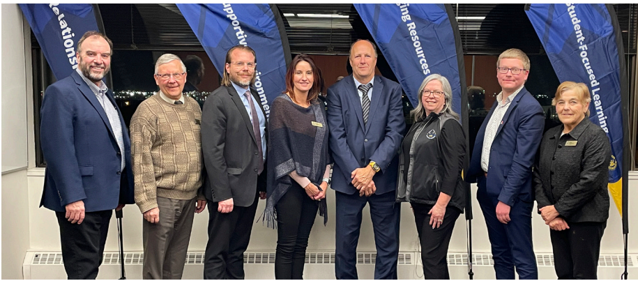
The Board of Trustees met with Leduc City Council on February 15, 2022.