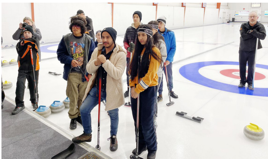
The Colombian students get a curling lesson at the Calmar Curling Club.